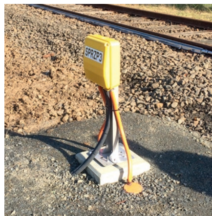
Installed detection point at Stony Point line

Keeping the rail line in operation has always been a priority, however, the line was closed while MTM worked to implement a permanent solution to ensure the safe movement of trains and to prevent ongoing disruptions to services. Prior to the works, level crossings on this line were activated by a conventional train detection system relying on the wheel-to-rail interface.